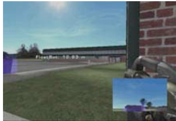
Figure 4. The augmented reality-based training scenario depicts the leader of a fire team employing an organic UGV and a SUAV to scan for land mines (blue area on left). Note that video feed of scan from UAV is in lower right corner.

In this training exercise, the squad will demonstrate its plan to accomplish the Mission in an augmented reality-based field environment (see Figure 4).