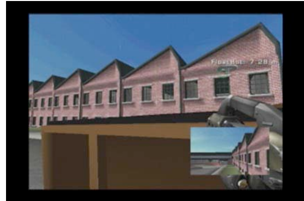
Figure 3. This AR training scenario demonstrates one soldier's perspective. While the building exists in reality, the SUAV (see video fee in lower right corner), the landmines, and opposing forces are digital.

storyboards are recommended for initial prototyping. Interestingly, this simulated AR training scenario could be used as a desktop simulation where soldiers could try out different strategies or practice specific skills before getting into the AR training environment.